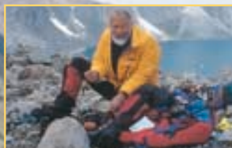
Sir Chris Bonington CBE, Britain's most distinguished mountaineer and active environmentalist, supports the CARE Challenge Series. Learn more about him at www.bonington.com

For more information visit www.climatecare.org